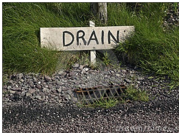
Rural Storm Drains are not always clearly identified. Locate storm drains near you and remove any potential pollutants that may be washed into the drain.

Lorain County Sheriff's Office Environmental Crimes Unit at: 440-329-3743 or 440-329-3759